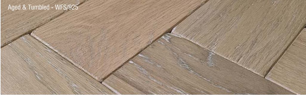
Aged & Tumbled - WFS/925

Each piece of flooring is tumbled and hand worked by our skilled craftsmen to achieve an authentic aged appearance to the edges and surface of the timber. With our colour options you have all the benefits of modern engineered processes with the looks, character and charm of a reclaimed floor.